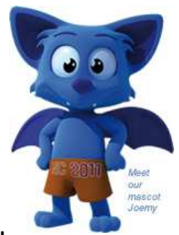
Meet our mascot Joemy

SWIFT: ANZBSBSB BSB Number: 010950 Account Number: 4793801